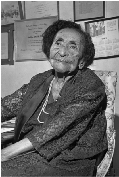
Eartha M.M. White