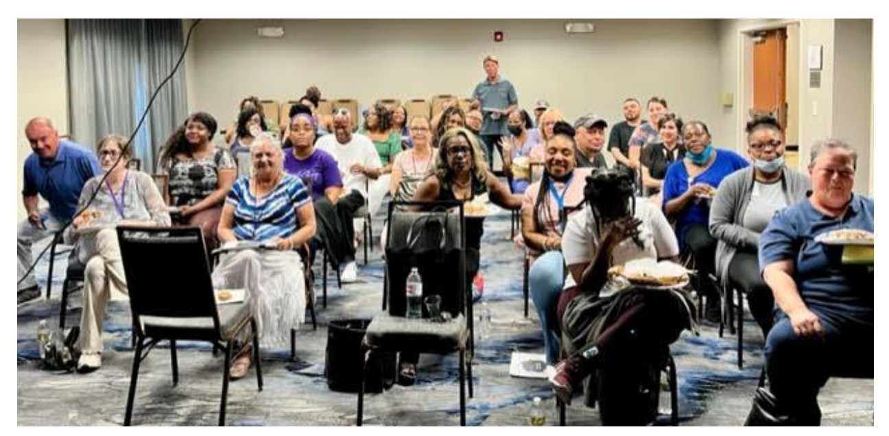
Our team in Charlotte

Thank you to everyone on our team who gave up their time for our townhall! We understand that this can be a bit disruptive to our work, but we are committed to bringing our company closer together. The best way to do this is by increasing our interactions and communications. Please share with your leaders what you liked or what might help these sessions get better, and we will endeavor to improve the program.